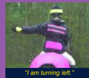
"I am turning left."

Riders should signal their intentions but drivers should be aware that horses are unpredictable and a rider on a young or frightened horse may have their hands full.