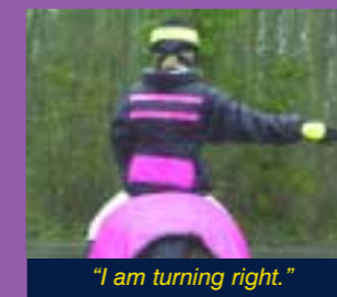
"I am turning right."