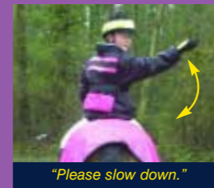
"Please slow down."